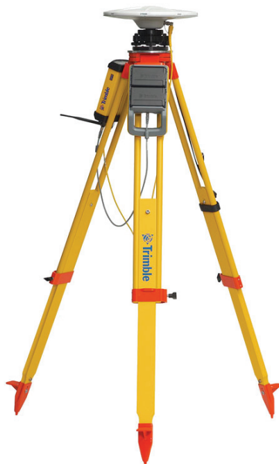
GNSS Base Station