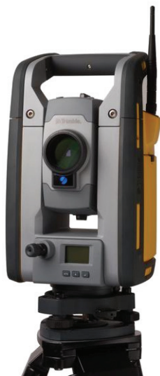
SPSx30 Universal Total Station